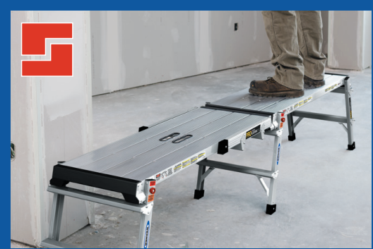
LINKING SYSTEM provides extra large, secure work surface