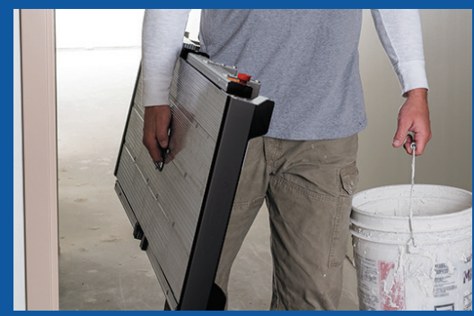
EASY GRAB HANDLE simple to carry your platform quickly and safely